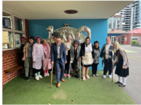
100 Days at school