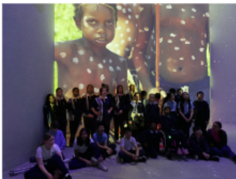
5/6 Inquiry Incursion