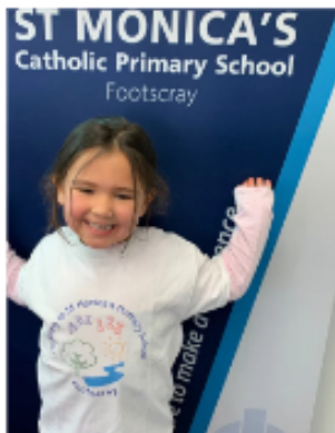
Meeting 2024 Foundation students