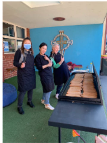
Volunteers in action