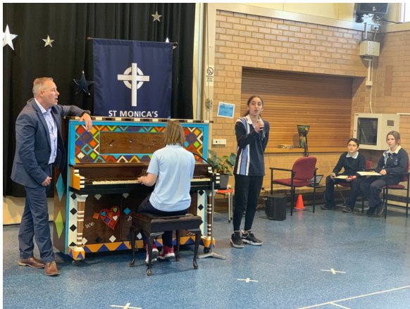
St Monica's Showcase of Talent