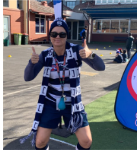
Footy Colours Day