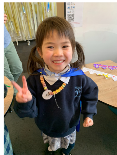
100 days at school