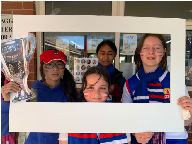
Footy Colours Day