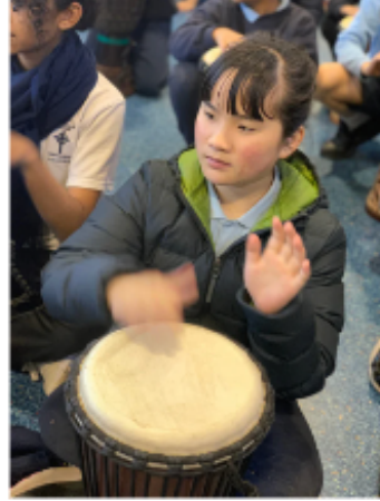
African Drumming incursion