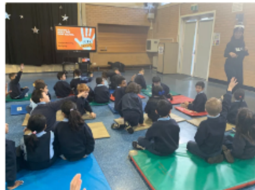
Bully Zero incursion