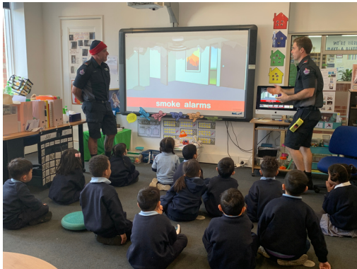
Fire Safety Incursion