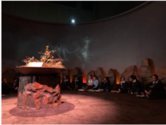
5/6 Inquiry Incursion