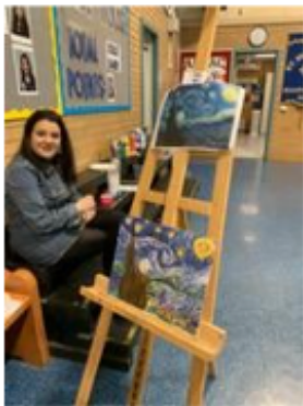
Vino and Van Gogh Fundraiser