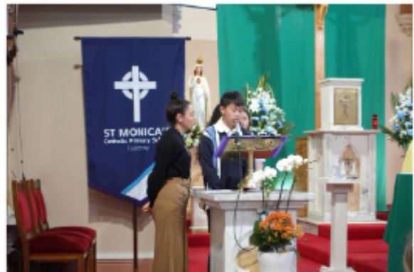
St Monica's Feast Day Mass