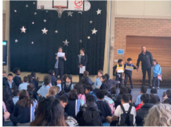
St Monica's Showcase of Talent