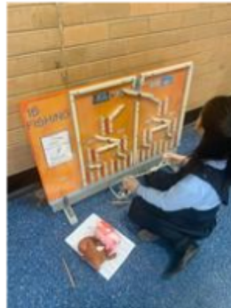
World of Maths Incursion