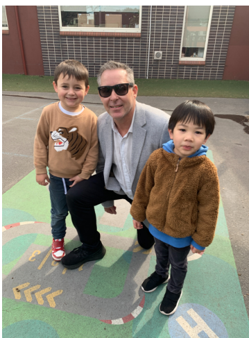
Stay and Play session with 2024 Foundation students