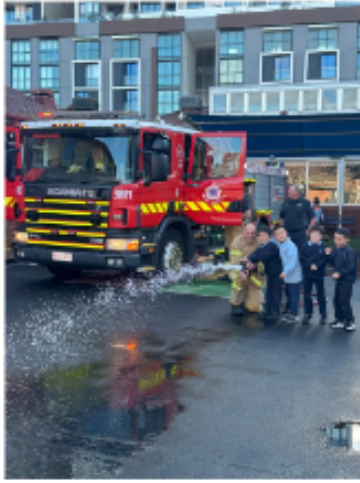
Fire Safety Incursion