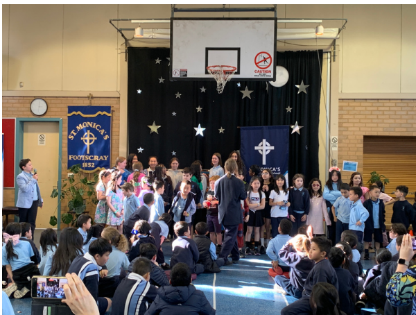
St Monica's Showcase of Talent