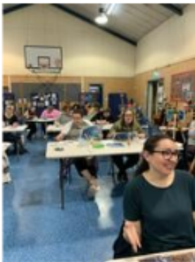
Vino and Van Gogh Fundraiser