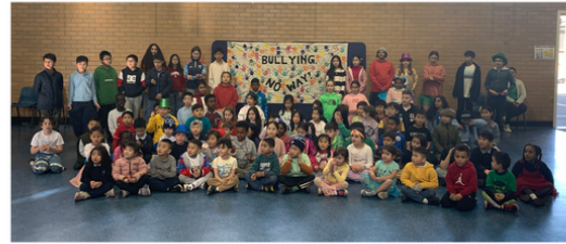
National Day Against Bullying