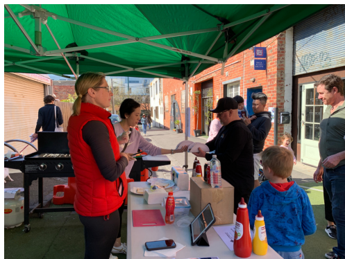
Parents & Friends