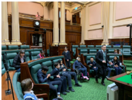
5/6 Inquiry Incursion