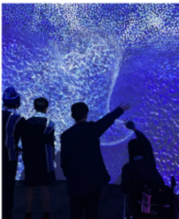
5/6 Inquiry Incursion