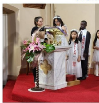
First Eucharist Mass