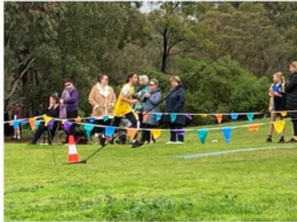
Regional Cross Country