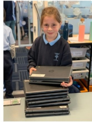
Learning with Technology