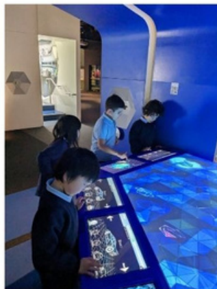
1/2 Science Works Excursion