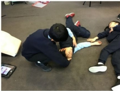
First Aid in Schools