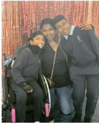
Mother's Day Breakfast