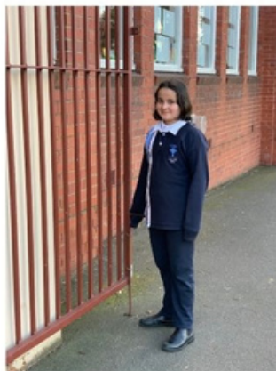
Leadership in Action