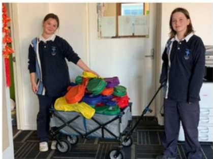
Music on the Move