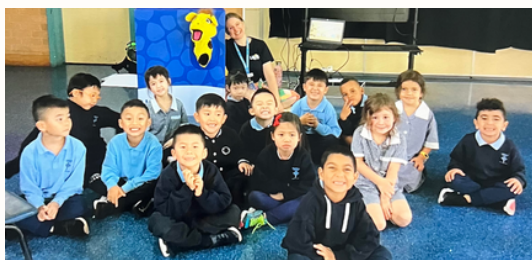
Foundation Students meeting Harold

St Monica's supports Life Education because we know that the biggest impact happens early in childhood. Children learn their core values at a young age. Tackling tomorrow's issues today leads to solutions to some of our biggest problems, such as chronic disease and mental ill health. The Life Ed program in schools teaches children the health, safety and wellbeing skills to make better decisions throughout their lives, creating a holistic impact on their long-term health. Importantly, we also acknowledge that we can't do it all on our own. As it says in the old proverb, 'it takes a village to raise a child.' Together, with parents, teachers, and children we are creating positive life-long health outcomes for our students