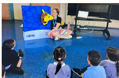
Year 5/6 Life Ed lesson